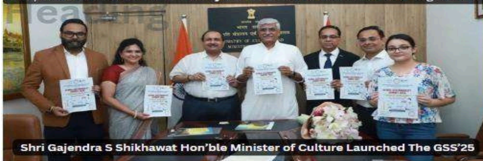
Shri Gajendra S Shikhawat Hon'ble Minister of Culture Launched The GSS'25